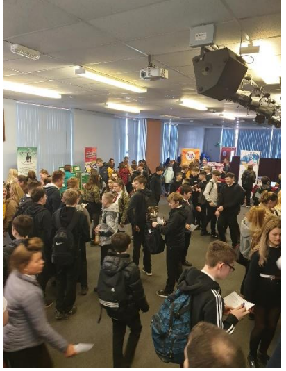
S2 Volunteering Marketplace

S4 Fire Skills with Scottish Fire & Rescue